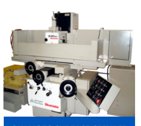
OKAMOTO SURFACE GRINDER