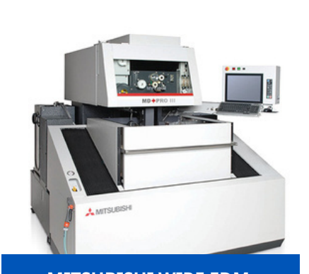
MITSUBISHI WIRE EDM