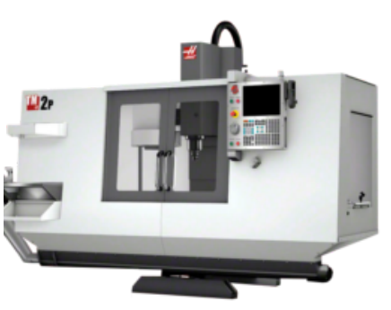
HAAS MILLING MACHINE