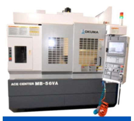
OKUMA HI-SPEED MILLING CENTER