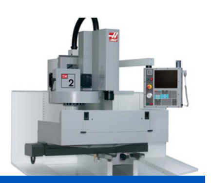
HAAS CNC MILL 3 AXIS