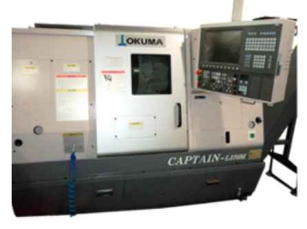
OKUMA LIVE TOOL LATHE